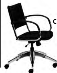
1022 A : 19" C : 15 1/2" - 20" E : 13"