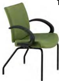
1070 P/PR A : 19 1/2" C : 17 1/2" E : 19"