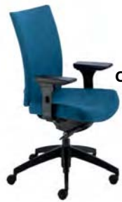
1090 A : 19 1/2" C : 16 1/2" - 20 1/2" E : 24"