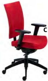
1080 A : 19 1/2" C : 16 1/2" - 20 1/2" E : 21 1/2"