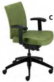
1070 A : 19 1/2" C : 16 1/2" - 20 1/2" E : 19"