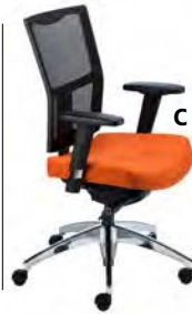
1082 A : 19 1/2" C : 16 1/2" - 20 1/2" E : 21 1/2"