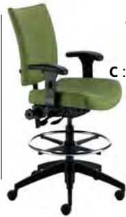
1070 DSN A : 19 1/2" C : 24 1/2" - 34 1/2" E : 19"