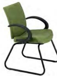
1070 T A : 19 1/2" C : 17 1/2" E : 19"