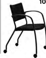
1012 P/PR A : 18" C : 17 1/2" E : 11 1/2"