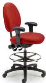
1990 DSN A : 19" C : 22 - 32" E : 18"