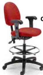
1880 DSN A : 17" C : 21 1/2 - 31 1/2" E : 15"